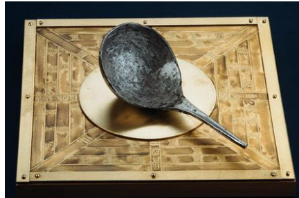
Plate 2. Ancient Chinese (“south-pointer”) compass (around 200 BCE) 98

He divides his wealth into four: One part he should enjoy, 97 With two he invests in his work, And the fourth he should save Should there be any misfortune.