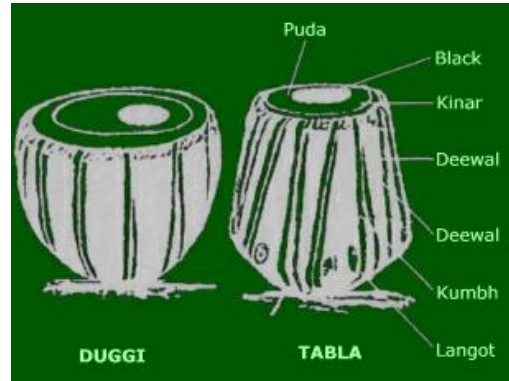
Plate 1. Indian drums: The duggi and the table

These, young householder, are the 6 dangers from devotion to gambling, a basis for heedlessness.